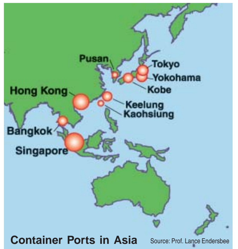
Container Ports in Asia

With the economic boom that such a perspective will unleash, our nation will suffer a huge labour shortage, and can joyfully open its arms to immigrants of many countries, who, in turn, will help build Australia. These "new Australians", along with the optimism unleashed by having our nation at last on the move once again, should return us to the fertility rates of the 1950s, and put us well on the path to having 50 million Australians by 2050.